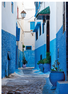
Rabat’s Kasbah des Oudaias

Day 11: Marrakech Once the capital of southern Morocco, the imperial city of Marrakech is an alluring oasis with a temperate climate, distinct charm, and fascinating sights. This morning we travel by horse-drawn carriage from Menara Park to Majorelle Gardens, a private botanical garden with some 15 species of birds native to North Africa and known for its cobalt blue accents. Following a tour of the gardens we visit the nearby Yves St. Laurent Museum, housing a vast collection of the designer’s haute couture and design works. After lunch at our hotel, mid-afternoon we embark on a walking tour of the medina , ending at Djemaa el Fna Square, a UNESCO World Heritage Site and the heart of Marrakech, crowded with snake charmers, entertainers, storytellers, musicians, barbers, and sellers of fruit, water, and spices. Dinner tonight is on our own in this exotic city. B,L