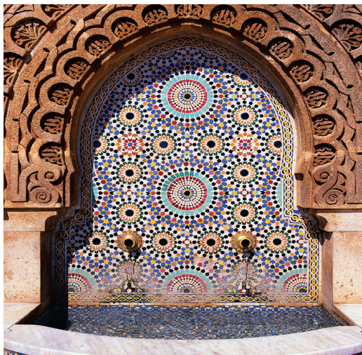
Traditional Moroccan tile work

En route to Marrakech today, we stop first at uninhabited Ait ben-Haddou, a UNESCO World Heritage Site and one of southern Morocco’s most scenic villages that is often used as a location for fashion and film shoots. Its old section consists of deep red kasbahs packed together so tightly they appear to be a single unit. Then, as we begin our descent from the High Atlas, we pass through typical villages with fortified walls and stone houses with earthen roofs. In Tizi N’Tichka, we traverse the Pass of the Pastures (alt. 7,415 feet), where life is much as it was centuries ago. We arrive in Marrakech late this afternoon and dine tonight at our hotel. B,L,D