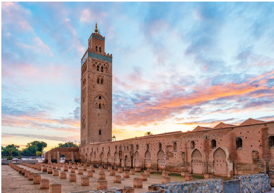
We see the distinctive Koutoubia Mosque – Marrakech’s largest – on Day 12.

showcasing intricately detailed tilework and carving decorations dating to the early 1300s. We then continue our discovery on a walking tour of the medina , focusing on the artisans’ quarters, the 14 th -century Koranic schools, and Al Karaouine, the medieval theological university. The remainder of the afternoon is free for independent exploration and lunch on our own. Tonight, we enjoy a private dinner at an intimate family-run riad in Fez. B,L,D