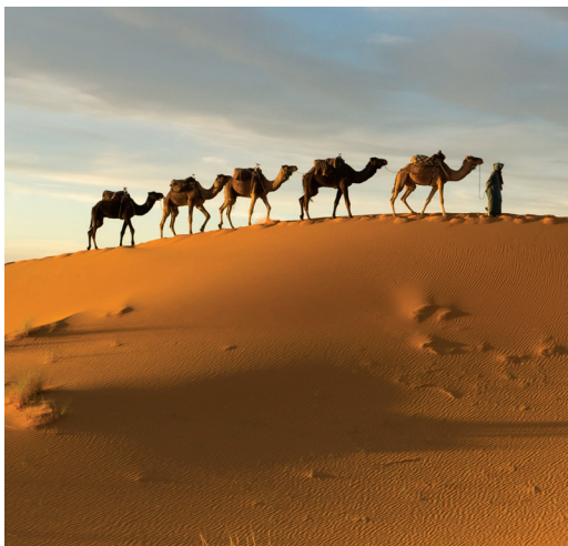
We ride camels in the Sahara on Day 8.

II Mosque, Morocco’s only functioning mosque open to non-Muslims. Tonight we celebrate our Moroccan adventure at a farewell dinner at a local restaurant. B,D