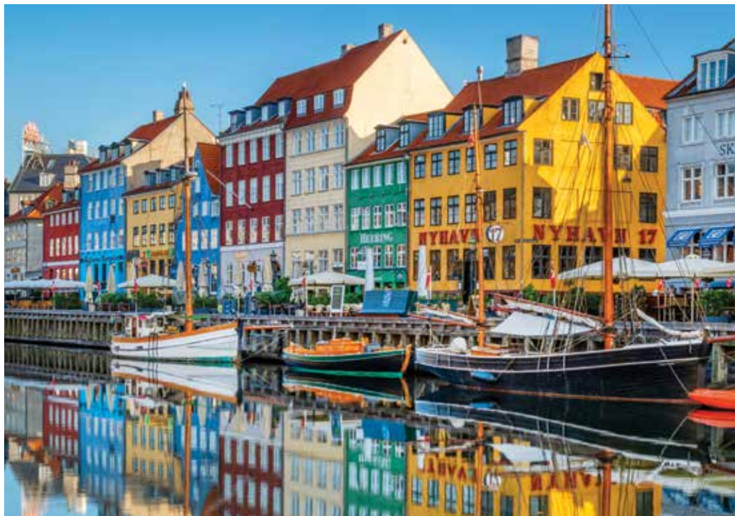
Copenhagen's lively Nyhavn waterfront area

Day 7: Hundorp/Geiranger A day of beautiful scenery is in store as we travel from Hundorp to Geiranger, en route negotiating hairpin bends to the summit of Mount Dalsnibba (alt. 4,900 feet) for stunning views of Geirangerfjord and the mountains, lakes, and waterfalls beyond. We reach the popular village of Geiranger mid-afternoon and get our first up-close look at Norway's most dramatic fjord. A UNESCO site, it measures 10 miles long and 960 feet deep. B,D