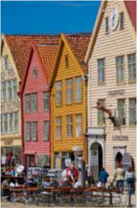
Bergen’s historic Bryggen district

Day 14: Oslo This morning we visit the Historical Museum, Norway’s largest collection of historical artifacts and ethnographic collections from the Stone Age and Viking era to modern times. We also tour