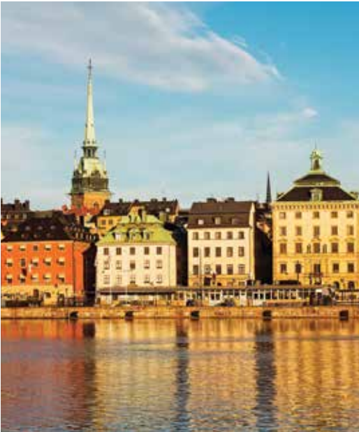
The sun sets over Stockholm, Sweden, as seen on optional extension.

Day 16: Depart for U.S. We transfer to the airport this morning for our return flight to the U.S. B